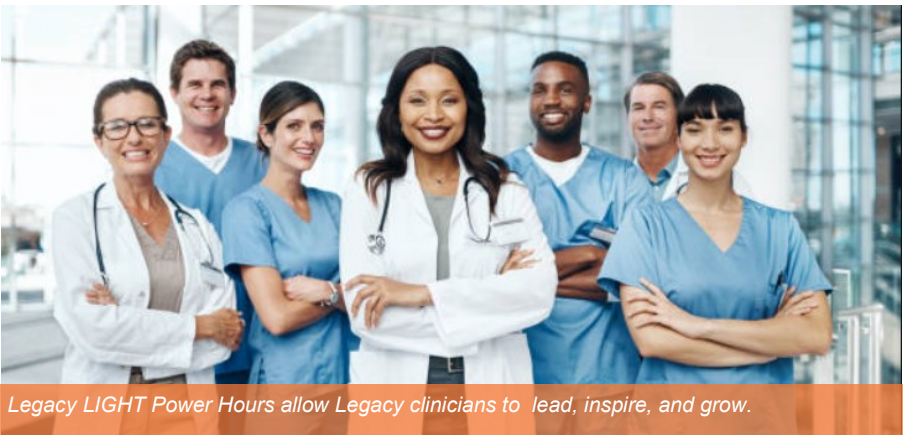
Legacy LIGHT Power Hours allow Legacy clinicians to lead, inspire, and grow.

Legacy Clinicians have the opportunity to participate in 6 Legacy LIGHT Power Hours each quarter.. Power Hours will fall into 1 of 5 categories, and clinicians will be compensated for their time.