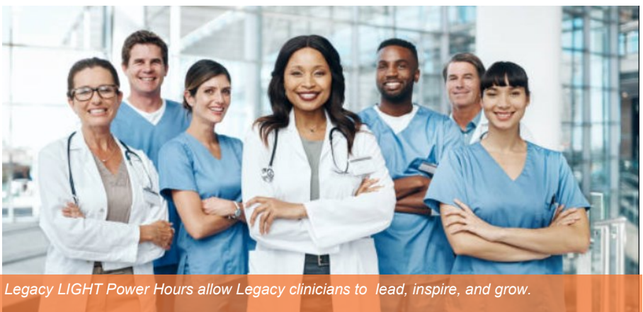
Legacy LIGHT Power Hours allow Legacy clinicians to lead, inspire, and grow.

Although not a formal pathway, opportunities are continuously available for physician coaching to help clinicians with professional development, clinical ops training support, and clinician wellness.